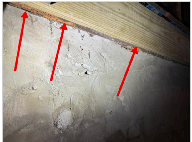
Left side band

Columns/piers, that did not appear to be original to the structure, were installed in the crawlspace that were temporary piers. This is a support/installation/movement concern. Recommend review and repairs by qualified contractor.