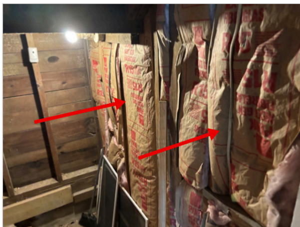
Stairs to cellar

The insulation was installed in areas of the crawlspace with the paper backing exposed. This is an installation/function concern as the paper backing is typically installed towards the conditioned side of the house. Recommend repairs by qualified contractor.