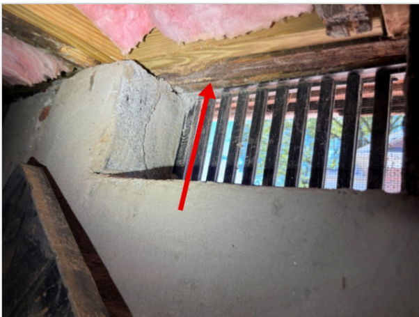
Left side band