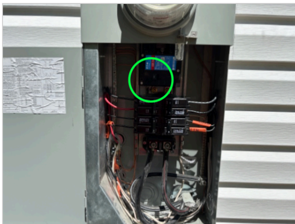
Main turn off

The main service panel is located on the exterior wall with an estimated 200 amp and 240 volt rated capacity. 120v branch circuits were copper. 240v branch circuits were aluminum and copper. The branch circuits were connected to breakers. There were no concerns observed within the main panel.